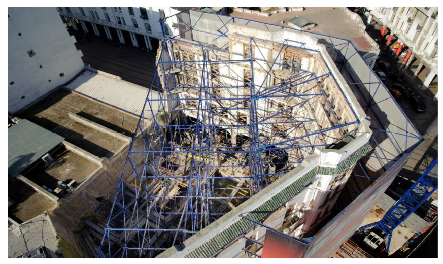
Figure 4: Example of Façadism: Building of the General Society in Casablanca Shoring Works, Photo Taken by Ibtissam Kourdou. 2013.

The walls of the "gourmet" building, which were in an advanced state of disrepair, urged the owners with the assistance of the Architect in charge of the Study of Elevation and Local Engineering Office, to opt for a solution, already experienced in Europe «facadism». They proposed to the planning committee responsible for granting the building permit, based on technical reports on the stability of the building, a new solution: «facadism».(figure 4)